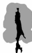
Sakhalin Environment Watch