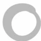
Friends of the Earth